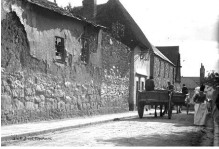
Back Street, Topsham

Another photograph taken by Cecil Holman (1877-1958), is of 'Back Street Topsham', what is now Follett Road and taken in the early 1900s. Back Street is a nickname for what was then known as Higher Passage Lane, leading down to Ferry Road.