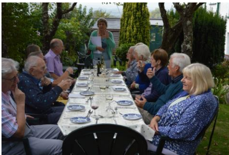
Head Stewards Lunch