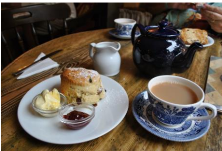
A delicious cream tea!

With the end of the 2014 season nearly upon us, the hardworking tea room volunteers are looking forward to a well-earned break.