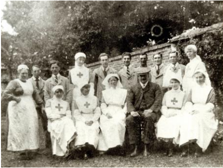
VA Hospital, Riversmeet Terrace

The plan is to mount an exhibition of images, memorabilia and biographies of as many of the men and women from the town who served in the war, in any capacity. We will not forget those who died and are commemorated on the War Memorial and in Peter Dunscombe's book. We hope that in the run up to 2016 we can bring the community together to discover stories about their relatives, neighbours and ancestors and forge new relationships for the future as well as creating a legacy of documents and photographs to contribute to the national archive. There must be many fascinating and moving stories which deserve to be recorded. So your comments, contributions and information are welcome, as always. Please contact Marian Grimshaw or Rosemary Hatch at the Museum if you can contribute to this important project.