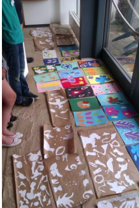
Summer holiday activities for children (above) and the Draw at Town Fayre (below)