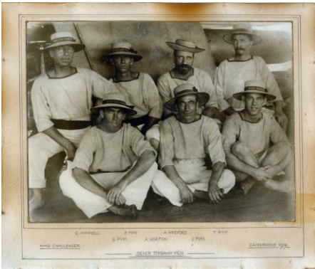
Seven Topsham Sailors, HMS Challenger, 1914

We hope that you'll soon be thinking of what to buy your friends and family for Christmas and that we will be able to help you at our annual Christmas Market in Matthews Hall on 20th November, 10.00-12 noon. You may not have been able to get to the Museum Shop lately but you will have the opportunity to see their range of lovely gifts. We have also again managed to line up some interesting stalls to help you solve all your Christmas shopping problems. Please do bring along your family, friends and neighbours for a coffee, a mince pie and a chat—we would love to see you!